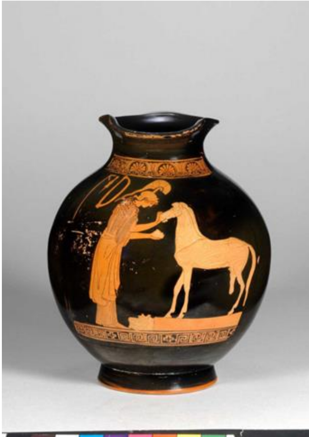
Figure 4. The horse's hind leg is unfinished. On the wall behind of Athena, goddess of crafts and wisdom, creating a clay model of a realistic Trojan horse to be cast in bronze (Mayor, 2023).

"What are the basic processes of cognition?", "What must the formal language do in order to provide an adequate medium for accurately and uniquely describing the world?", and "Can thought be automated?" (Flasiński, 2016). All of these questions were of interest to scholars of ancient times and are, in themselves, hypotheses related to the possibility of developing machines that can think as humans do and perform their daily tasks and work.