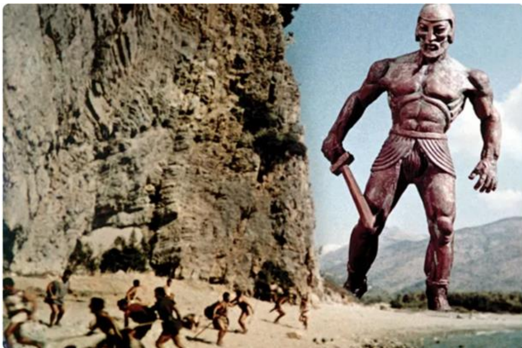
Figure 1. An imaginary image of the robot (Talos) (Markham, 2023).

raising questions about the boundaries between the natural and the artificial, between the human and the non-human, between slavery and freedom, and between mortality and immortality. The narratives about automatons (self-moving machines), such as those presented by Philo and Hero of Alexandria, show that such innovations were not mere products of imagination. Long before science fiction literature depicted dystopian worlds caused by technological human-like beings, the ancient Greeks and Romans expressed concerns about such entities. In ancient literature, robots vary from the beneficial, like the golden maids made by Hephaestus, to the destructive, like Pandora and Talos (see Figure 1). Furthermore, the statue of Pygmalion's Galatea, which closely resembles Pandora, inspired many contemporary works of art, such as the films Ex Machina and Her . Themes from the stories of Pandora and Galatea appear frequently in 20th and 21st-century literature, such as in the works of Isaac Asimov, Philip K. Dick, and the many films based on their writings (Donovan, 2023).