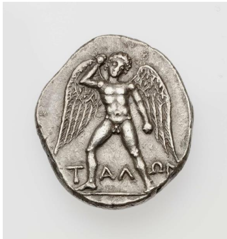
Figure 2. A silver coin depicting Talos with wings and rocks on each hand. 5th century BC (Lykiardopoulou, 2023).

Talos' role in mythology extends beyond his physical form; he symbolizes the power and potential of technology, where machines were designed to serve and protect